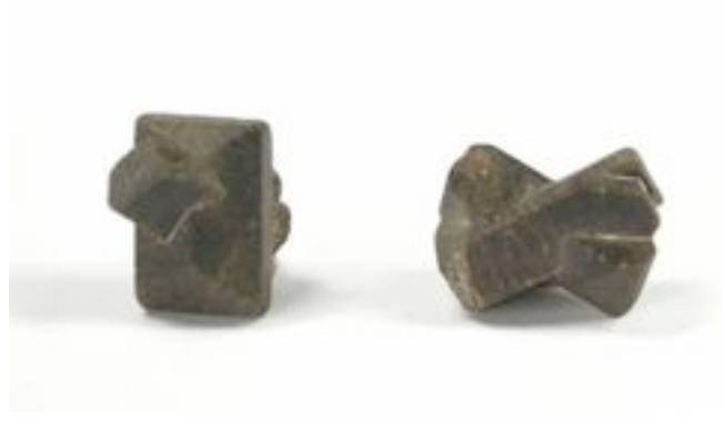
Photo: Staurolite twins, Fannin County, Georgia